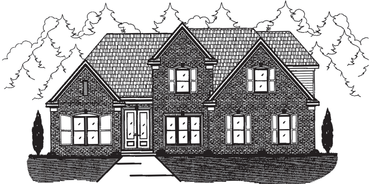
The "Sycamore" Collierville, TN 38017